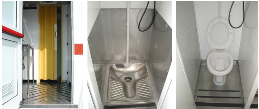
Interior details: entrance/exit – stall with "Turkish" toilet – stall with "standard" toilet