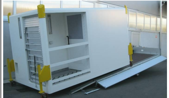
View of module in load/unload mode from the tilt-bed trailer