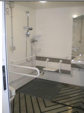
Details of the special cabin for the diversely able