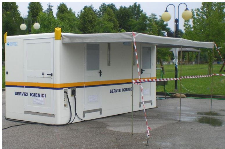
View of the unit's technical compartment and entrance side, set on the ground