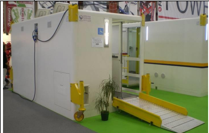
External view of the access platform/ramp